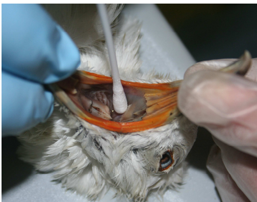
Oral swabbing a dead ring-billed gull.