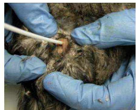
Cloacal swabbing technique.